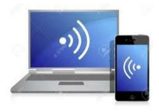
Fig2: Monitoring section

Monitoring section: Fig2 shows the monitoring section it consists of Android mobile phone or laptop. In this Bluetooth Received the data from the tracking section that information will be displayed on the application